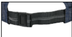
Nylon Strap with Plastic Buckle