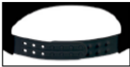
Double Plastic Snap