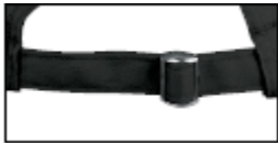
Tuck Strap with Slide