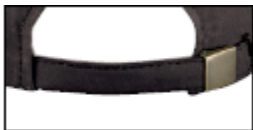
Tuck Strap with Buckle or Snap Buckle